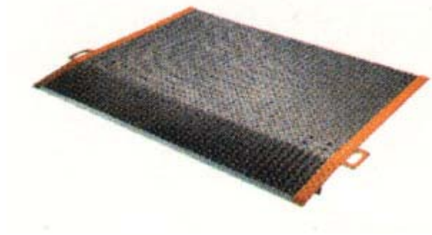
Dock Plate (Steel)