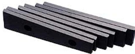
6Pcs Set - 1/2° Thru 5°