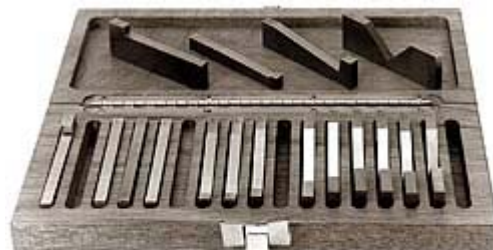
STC# CBL0305 17Pcs Angle Block