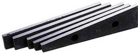
5Pcs Set - 6° Thru 10°