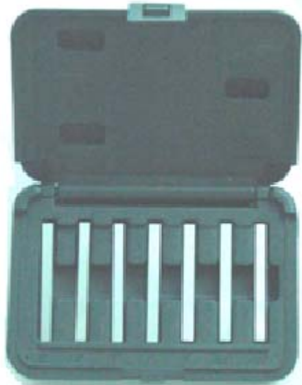
STC# CBL0313-B 7Pcs Set with Plastic Case

12Pcs Set Includes: 1/4°, 1/2°, 1°, 2°, 3°, 4°, 5°, 10°, 15°, 20°, 25°, 30°