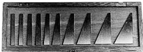
STC# CBL0306 10Pcs Angle Block Set