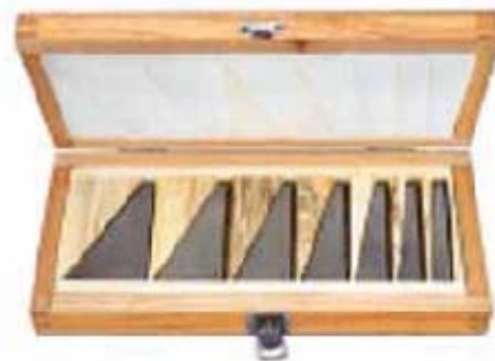
STC# CBL0313-W 7Pcs Set with Wood Case