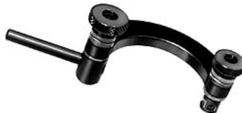
Half Round Combination Holder with two point adjustment & 1/4" Shank