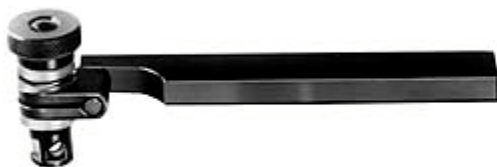
Rectangular Holder with 1/4" x 1/2" shank