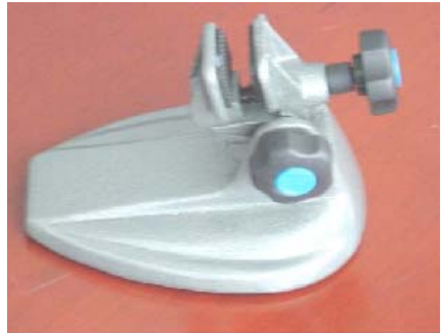
Style A CMI0290