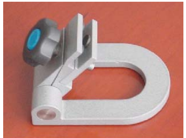
Style D CMI0290-3