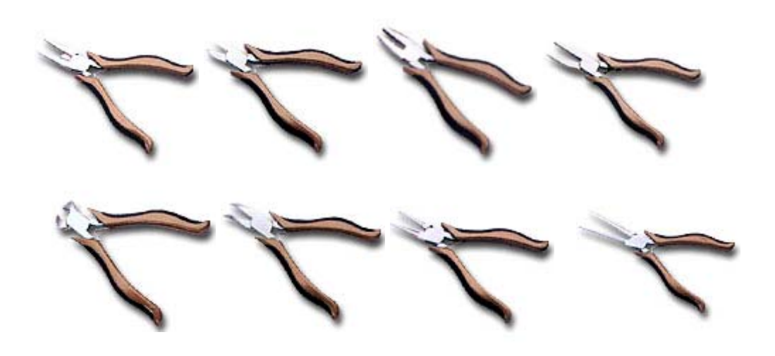
Box Joint Niklear multi-layer plating and coating Hardened and tempered jaws Two leaf sping keep jaws open for quick use Softgrip handle