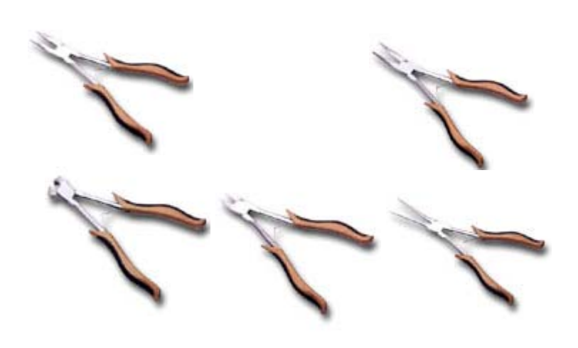
Box Joint Niklear multi-layer plating and coating Hardened and tempered jaws Two leaf sping keep jaws open for quick use Softgrip handle